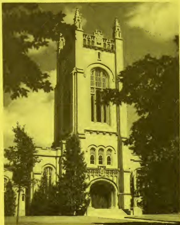
SKINNER MEMORIAL CHAPEL CARLETON COLLEGE NORTHFIELD, MINNESOTA